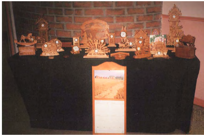
Clocks and calendar holders made in the Harvest House woodshop

By volunteering in our phone sales room, residents learn to express themselves clearly and communicate in a professional manner. As they share their stories with members of the community, they also gain confidence and come to realize just how many people care about them. Harvest House residents have been blessed countless times by the compassion of those on the other end of the line. Today, most of our funds come from donors in the Ottawa area who received a sales call from one of our residents.