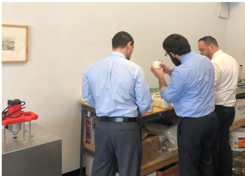
Harvest House residents learning to make candles.

We also thought that candles were a great way to represent the light that people like you shine into the lives of the men at Harvest House. When you support Harvest House, you attack the darkness of addiction and shine light into a young man's future.