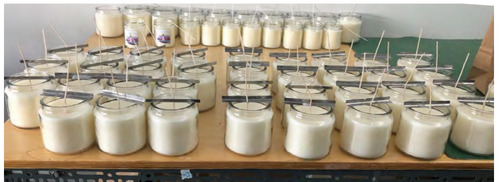
Harvest House candles waiting to dry.

Our social entrepreneurship has been a huge success for Harvest House's fundraising. But it's also led to individual success for graduates of our program. Using the professional skills they learned at Harvest House, graduates have gone on to own successful businesses, work in sales and management, and earn university and college degrees in a variety of majors. Our goal at Harvest House is not simply to help men get sober, but to provide them with the skills they need to be successful members of the community.