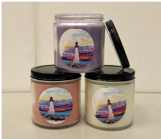
Our new lighthouse candles!

on the side of the road. It was a huge success! And it all started with a simple sign: "Picnic tables for sale!" Building and selling these tables gave residents a sense of accomplishment, allowing them to use and develop their skills.