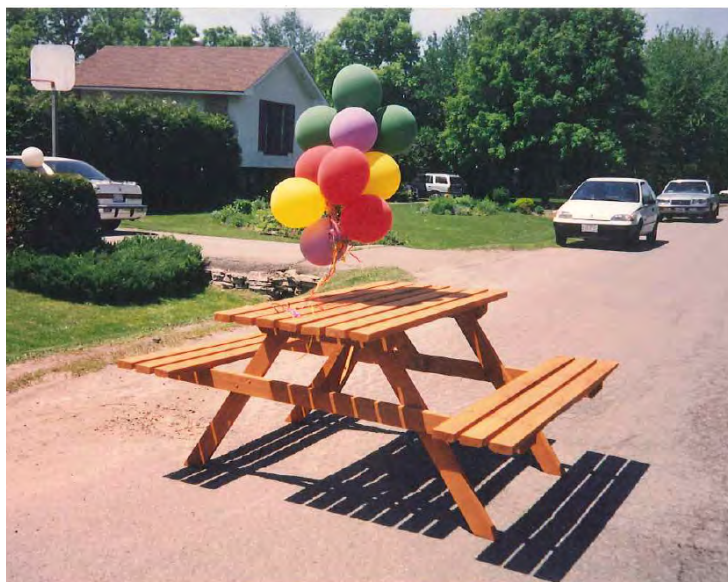
Harvest House picnic table from the late 1980s

When Harvest House started in 1979, it was in a 4-bedroom house with eight residents and a staff of only three volunteers. To help additional addicted young men, we needed to bring in funds. So, in the 1980s, Harvest House started selling handmade picnic tables