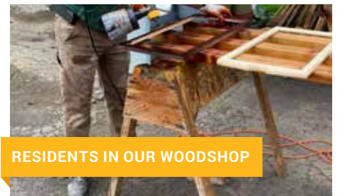
RESIDENTS IN OUR WOODSHOP